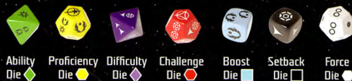
Ability Die ◆ Proficiency Die ◆ Difficulty Die ◆ Challenge Die ◆ Boost Die ■ Setback Die ■ Force Die ◆

Threat ☹ symbols indicate a negative side effect or consequence, even on a successful check. They cancel and are canceled by Advantage ☺ symbols.