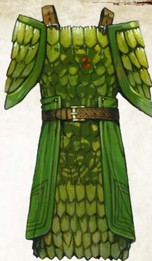
WILD HIDE ARMOR