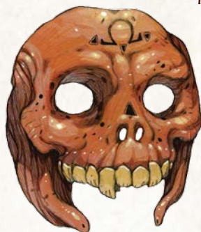
MASK OF THE SKULL