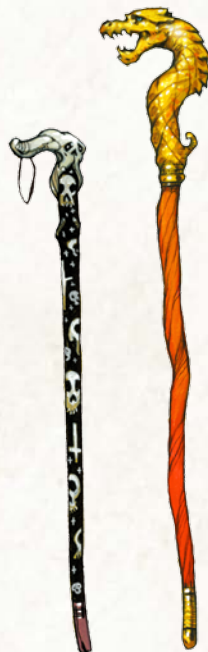
ROD OF WONDER