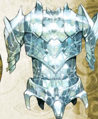
MITHRAL FULL PLATE OF SPEED