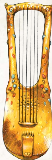
LYRE OF BUILDING