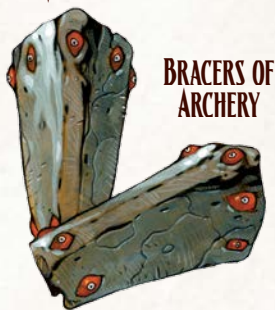
BRACERS OF ARCHERY