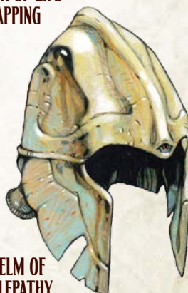
HELM OF TELEPATHY