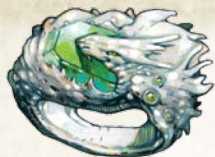
RING OF REGENERATION