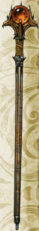
STAFF OF POWER