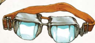
GOGGLES OF MINUTE SEEING