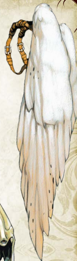
WINGS OF FLYING