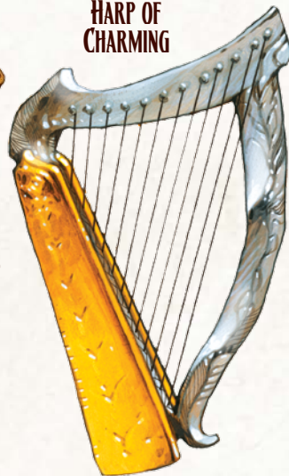
HARP OF CHARMING