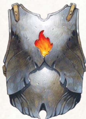
BREASTPLATE OF COMMAND