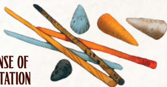
INCENSE OF MEDITATION