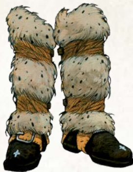
BOOTS OF WINTERLANDS