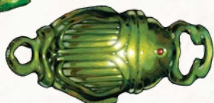
SCARAB OF PROTECTION