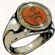
RING OF PROTECTION