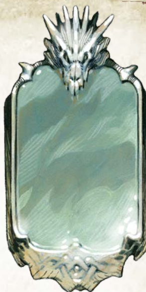
MIRROR OF LIFE TRAPPING