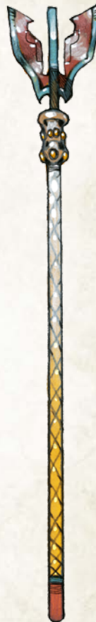
STAFF OF PASSAGE