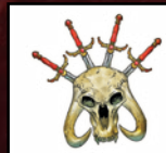
RIGHTEOUS MEDAL OF VALOR