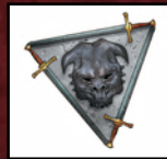
RIGHTEOUS MEDAL OF AGILITY