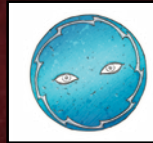
RIGHTEOUS MEDAL OF CLARITY