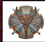
RIGHTEOUS MEDAL OF COMMAND