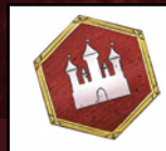
RIGHTEOUS MEDAL OF VIGOR