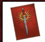
RIGHTEOUS MEDAL OF SPIRIT