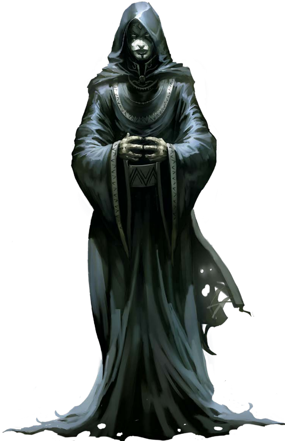
PRIEST OF RAZMIR