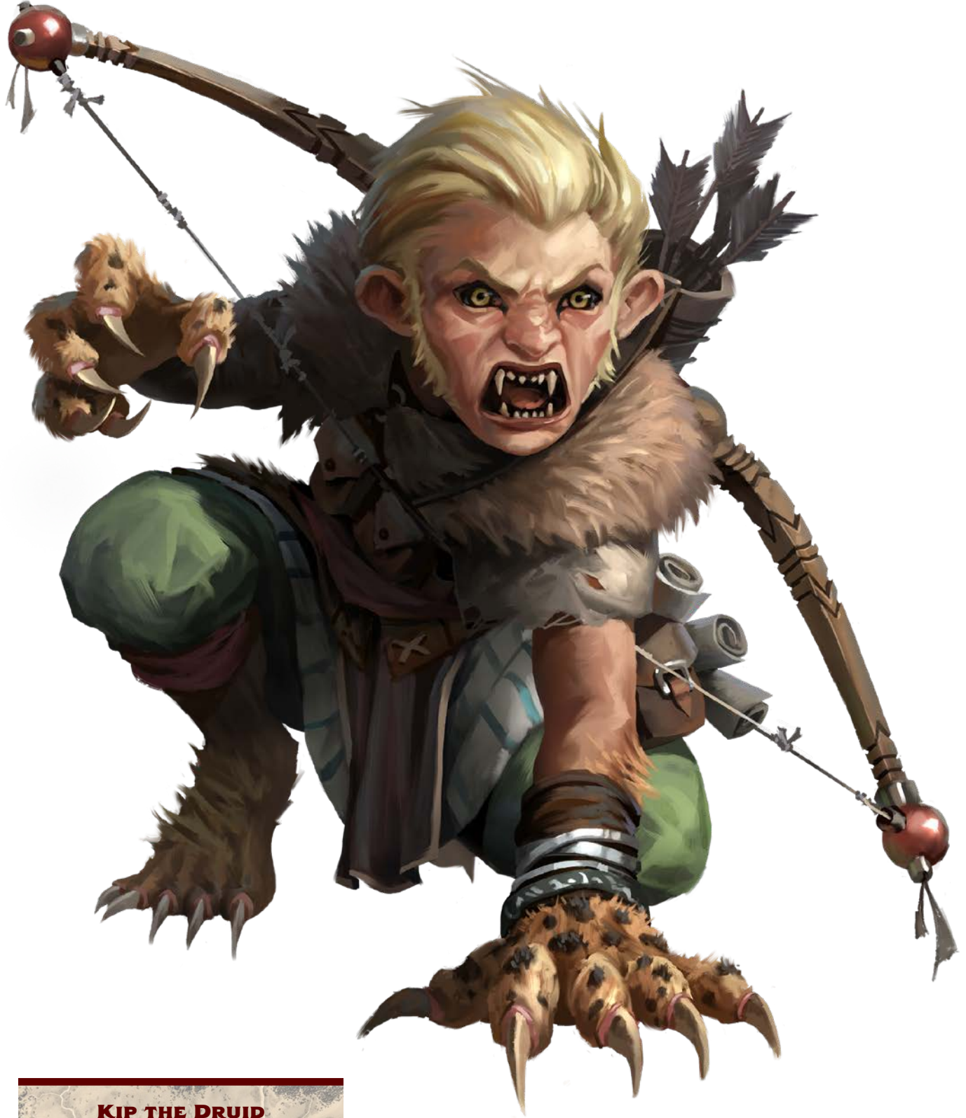
KIP THE DRUID