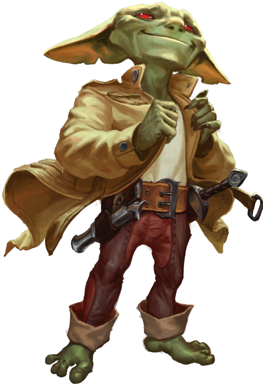
ZIG, EXPEDITION LEADER