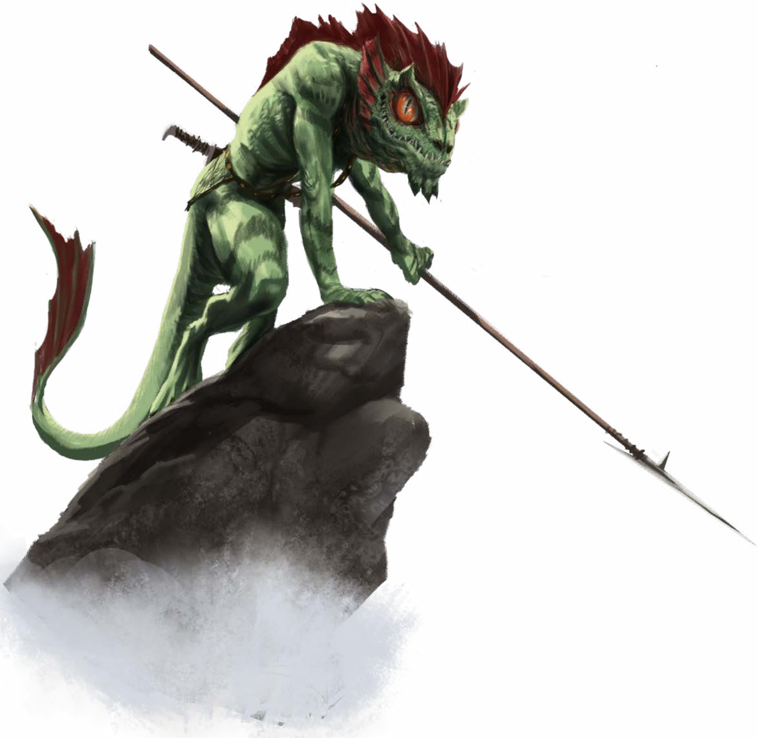
SEA DEVIL SCOUT