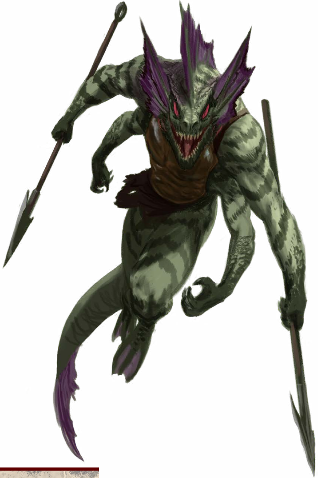
SEA DEVIL INVADER