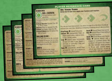
4 Player Reference Cards