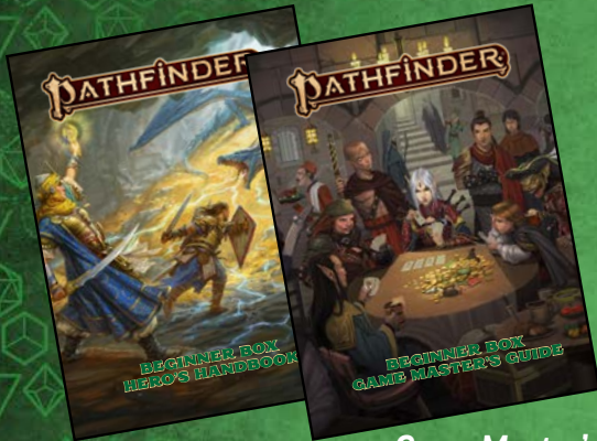
Game Master's Guide