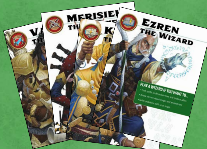
4 Pregelated Character Sheets