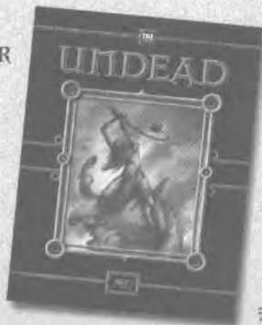
Illustration by Jim Pavelt © 2001 AEG

Packed with details on becoming undead, the spirit world beyond, rules for imbuing spirits into magic items, more spells, and over 10 prestige classes, this book promises to provide GMs and PCs with months of campaign ideas. From the team that brought you Dragons and Evil , comes a new dimension in fantasy gaming. (128 Pages, Softbound)