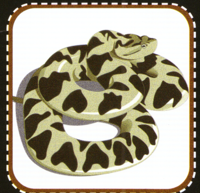
Giant Constrictor Snake