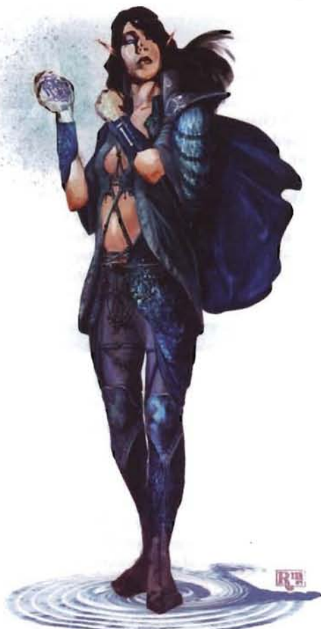
CHAPTER 2 | Character Classes

Your psionic ability alerted you to the growing aberrant threat at a young age. Despite being a psionic weapon against aberrant spawn, you sought out even more potent weapons. While in the depths of a psionic trance, you glimpsed the original